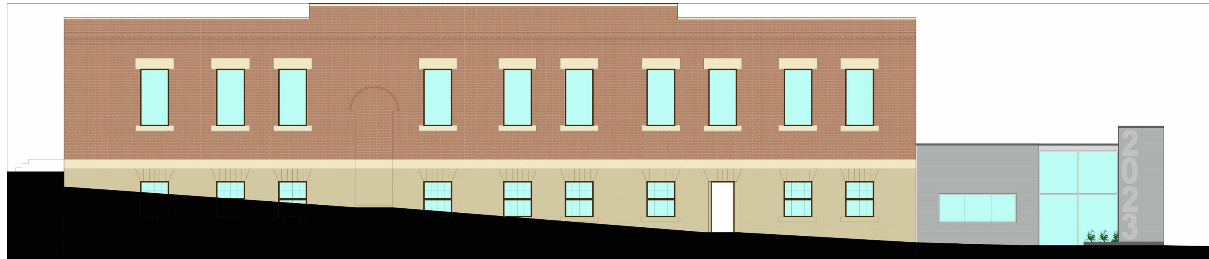
2 WEST ELEVATION A2.1 SCALE: 1/8" = 1'-0"